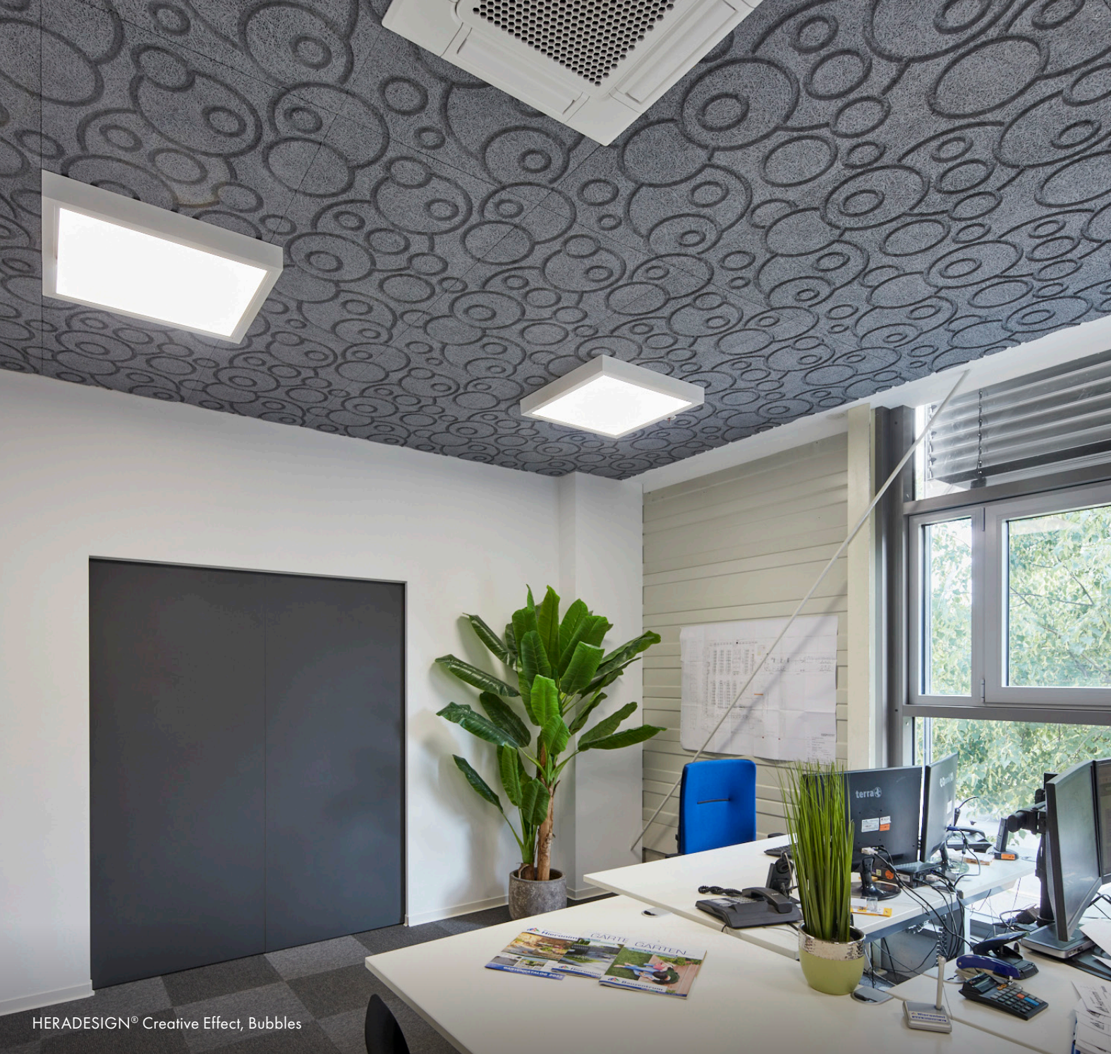
HERADESIGN® Creative Effect, Bubbles