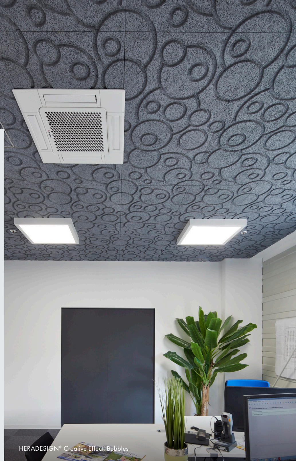
HERADESIGN® Creative Effect, Bubbles

Distinctive for this solution are the acoustic panels with regular ("Groove") and irregular patterns ("Bubbles" and "Turtles"). The milling technique employed has crafted shadow gaps, introducing depth and character to the ceilings.