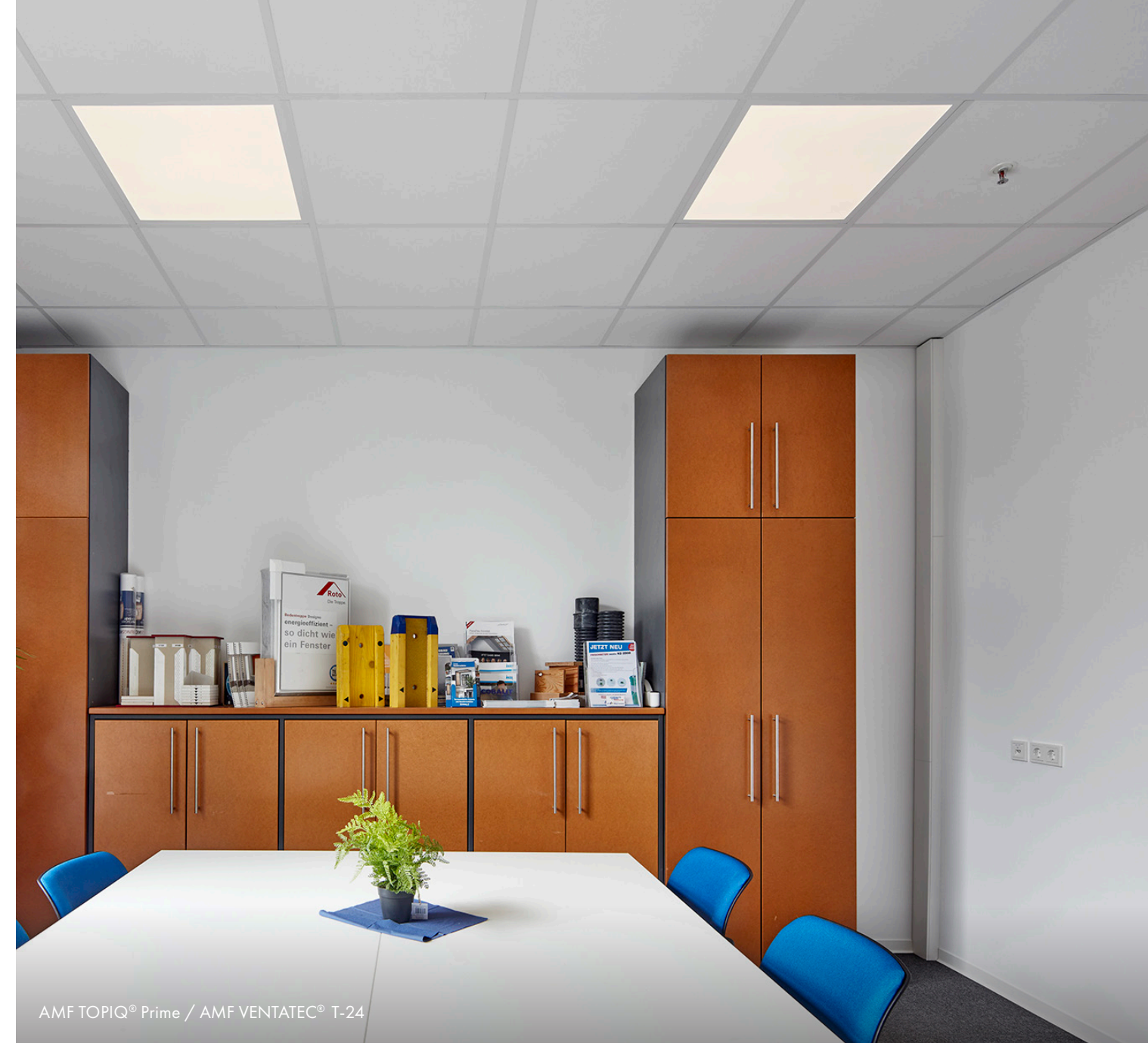
AMF TOPIQ® Prime / AMF VENTATEC® T-24